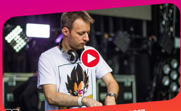
LIVE @ ELECTRIK PARK FESTIVAL 2017 youtu.be/gdTbYgRUIKc

Find out more: www.youtube.com/@MuttonheadsOFFICIAL