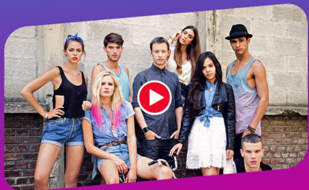
SNOW WHITE (ALIVE) youtu.be/Dvs6Mq7GOWs

Find out more: www.youtube.com/@MuttonheadsOFFICIAL